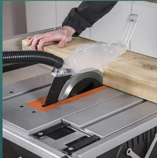
Overseas Industrial Technical Institute version 1.3