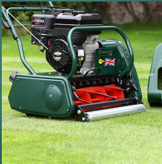
Overseas Industrial Technical Institute version 1.3