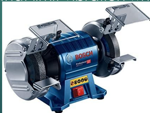
Overseas Industrial Technical Institute version 1.3