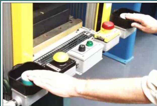
Two-hand Control on a Press

The operation should be constructed so that if one or both buttons are released, the hazardous action of the machinery and/or equipment cannot be reached, or if it can, the system returns to a safe state.