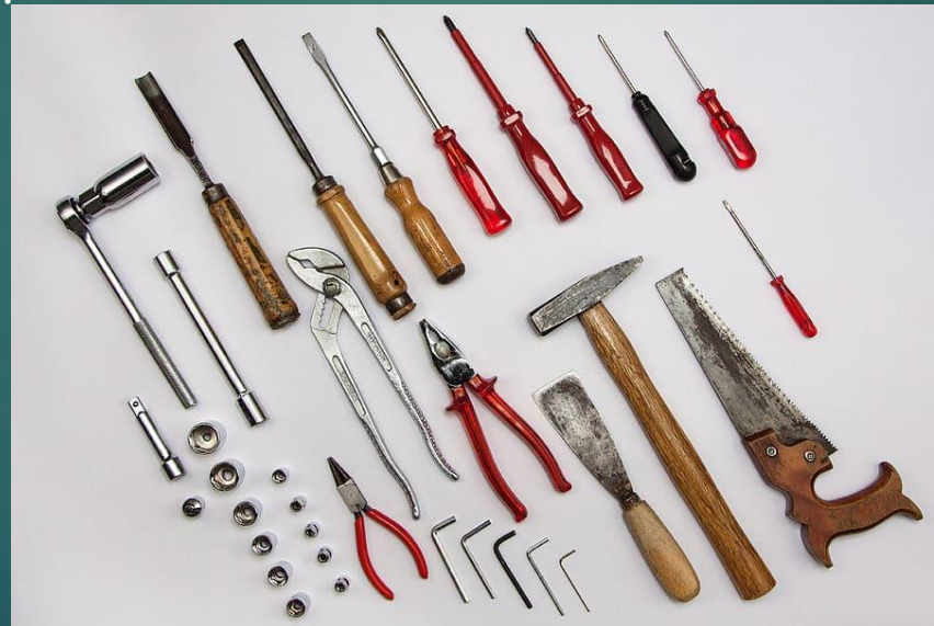
Overseas Industrial Technical Institute version 1.3